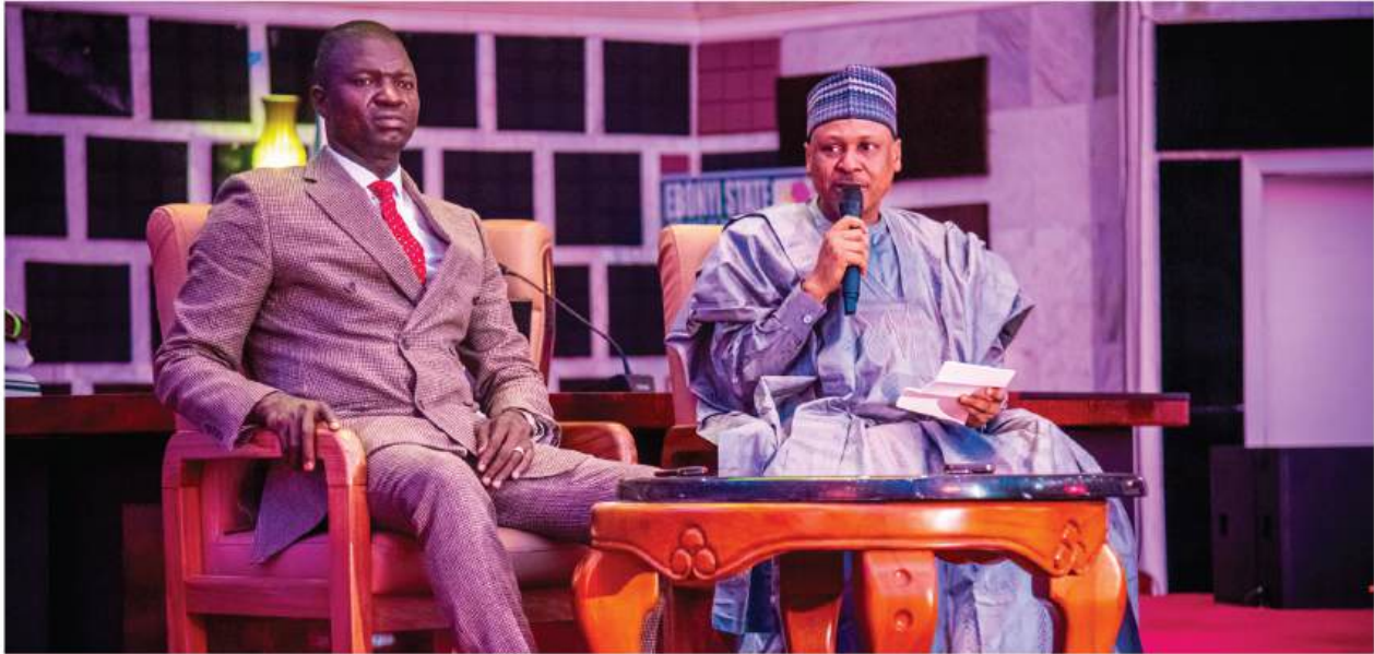
Courtesy Visit to the Governor